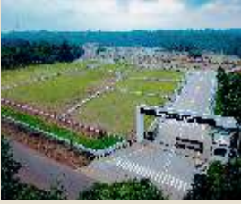
ROHAN ESTATE Pakshikere, Mangaluru