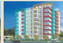
PLAMA HABITAT Kulshekar, Mangaluru