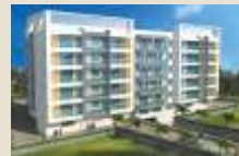
ODYSSEY Arya Samaj Road, Mangaluru