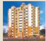
CONCORD Falnir, Mangaluru