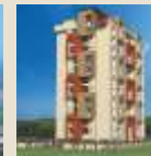
HIGHGROOVE Bejai, Mangaluru