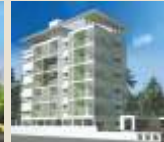
CATALONIA-I Kulshekar, Mangaluru