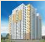
SILICONIA Kuttar, Mangaluru