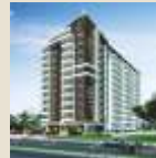
PRIMERO Padil, Mangaluru