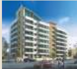
INFINITY Kankanady, Mangaluru