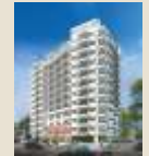
BELLISSIMA Mallikatta, Mangaluru