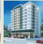
MICASA Bejai, Mangaluru