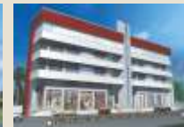
PAM ARCADE Kottara, Mangaluru