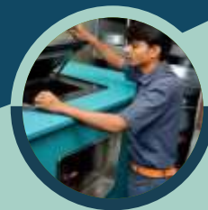
Organic waste convertor