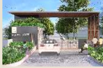
ROHAN ESTATE Baithurli, Kulshekar, Mangaluru