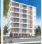
CATALONIA-II Kulshekar, Mangaluru