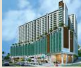
ROHAN SQUARE Capitanio, Mangaluru