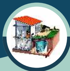
Rain water harvesting