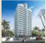
HILL CREST Ladyhill, Mangaluru