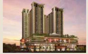
ROHAN CITY Bejai, Mangaluru