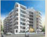
PETERS COTE Kankanady, Mangaluru