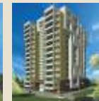
SERENITY Bejai, Mangaluru