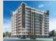
VENTURA Bejai Main Road, Mangaluru