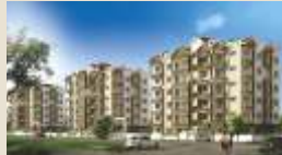
DAIJIWORLD RESIDENCY Bondel, Mangaluru