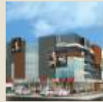
CITY SQUARE M.G. Road, Mangaluru