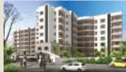
EXOTICA Bendore, Mangaluru