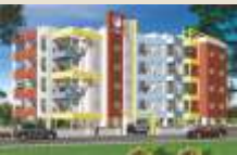
LUMINUS Kulshekar, Mangaluru